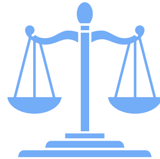
The rule of law