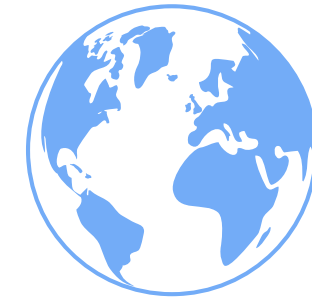
Tolerance of those with different beliefs and faiths